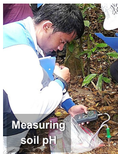
Measuring soil pH