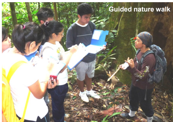
Guided nature walk