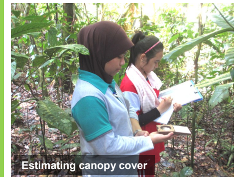
Estimating canopy cover